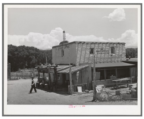
Post office. Costilla, New Mexico. 1940.