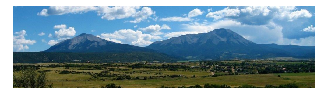
From my desk

La Plaza de Arriba in Costilla, New Mexico. The road in the picture is New Mexico State Highway 196. Costilla is in Taos County